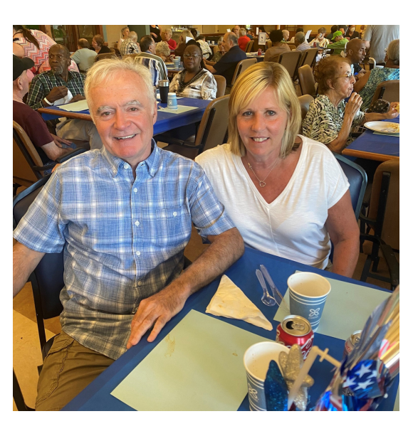
Please join us for our annual Family Picnic on August 15th. Make memories with your loved ones and get to know the ADC family.