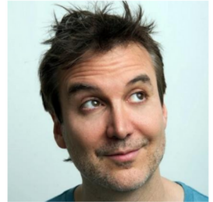
Brian Scott McFadden